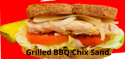
Grilled BBQ Chix Sand.