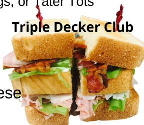
Triple Decker Club

BBQ Marinated Chicken Breast served on Rye Bread, Fried Onions, Swiss Cheese, Tomato, & Lettuce